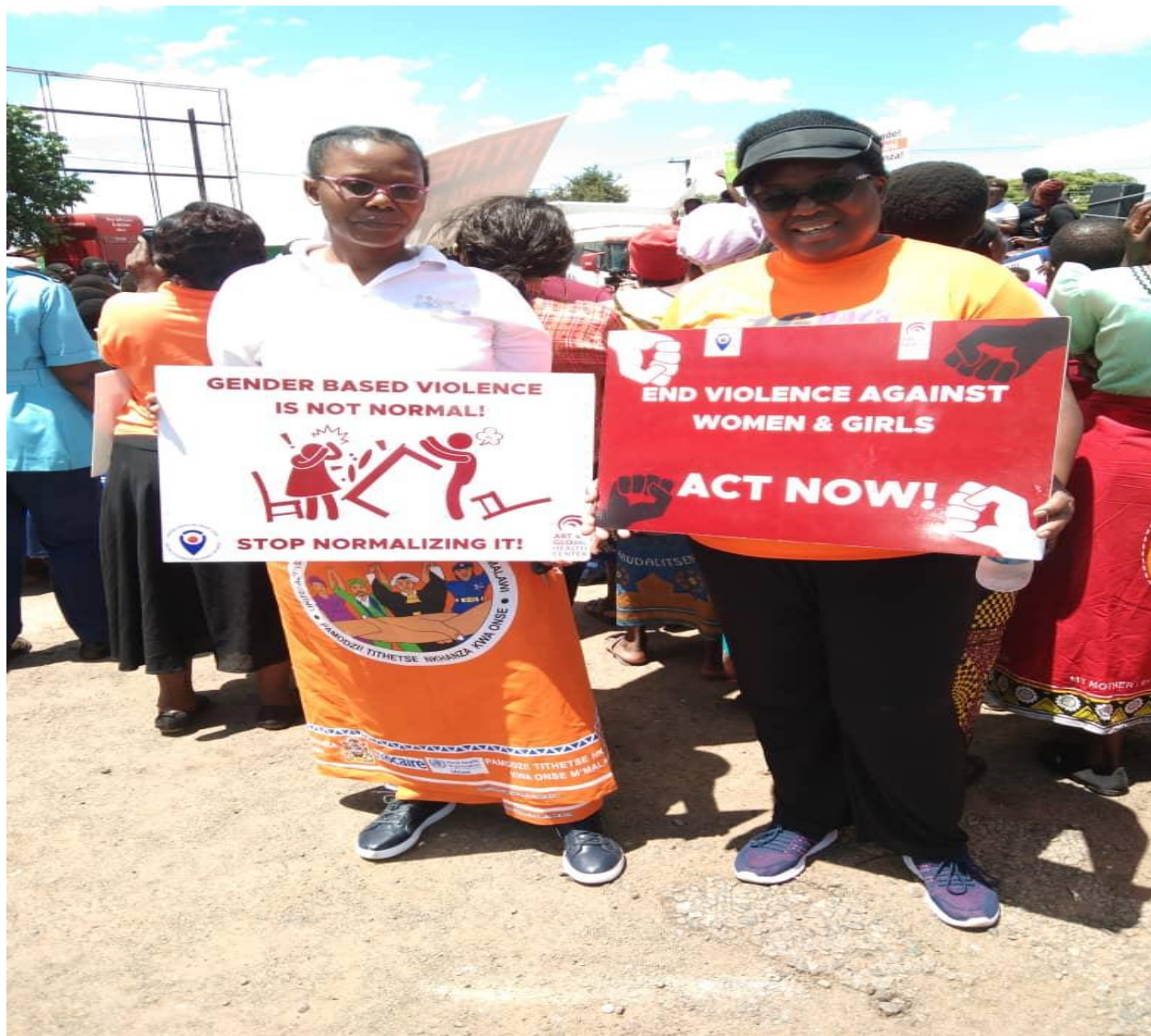
YWCA finance & administration manager with the programmes manager captured during the commemoration of "16 days of activism against GBV" in Blantyre district on 13th December, 2022