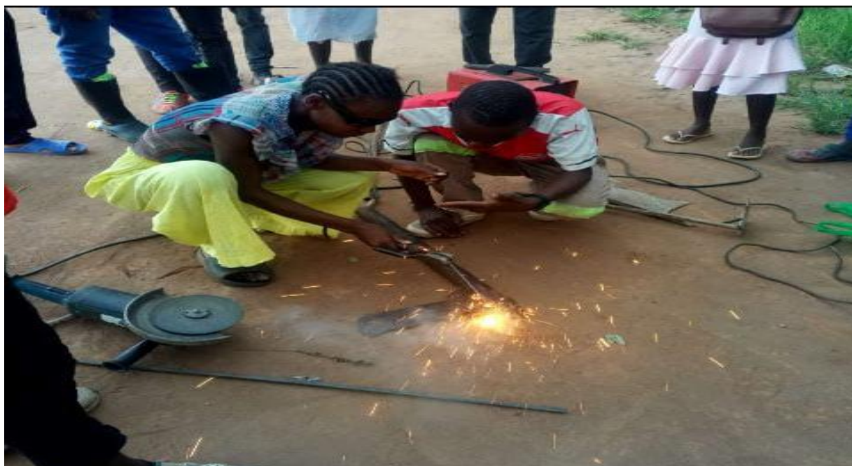
AGYW (from Mtenje in Blantyre) captured during one of their skills development (welding) sessions with the District Youth Office under the National Youth Service project on 25th February, 2023 in Blantyre.