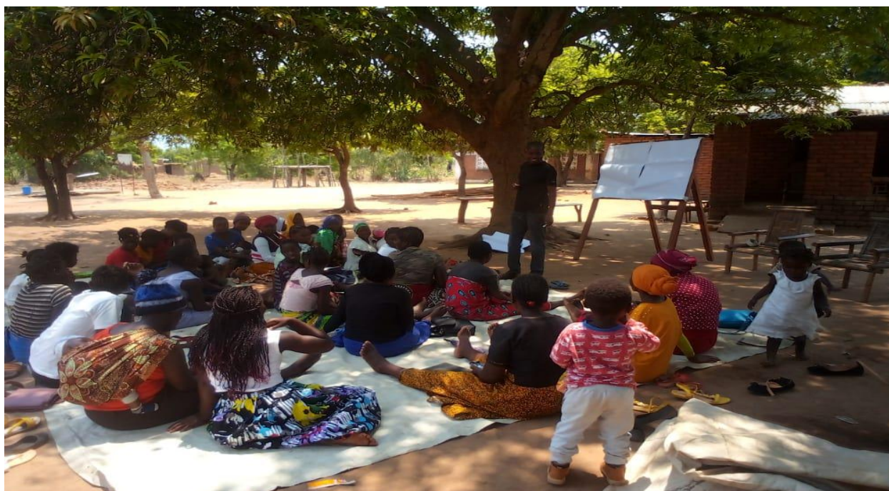
Psycho-social support session for adolescent mothers from Yanko CBCC (Misewe village - T/A Chamba) in Machinga on 18 th October, 2022