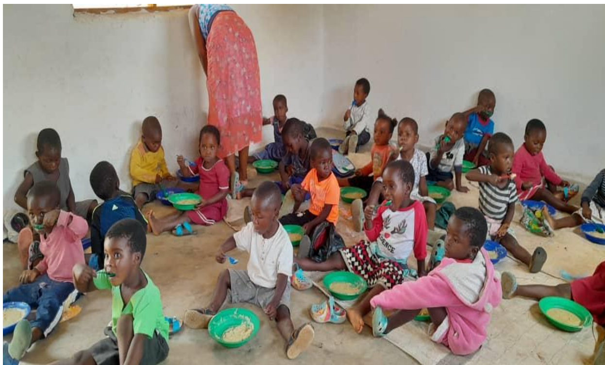
Children enjoying a nutritional meal at Mwaiwathu (CBCC (Nkhukuten village - T/A Machinjiri) in Blantyre on 4 th November, 2022.